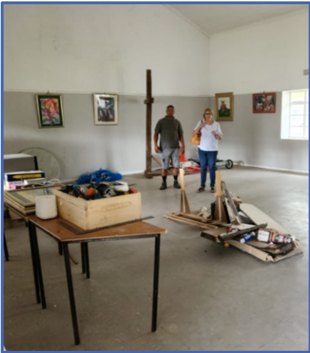
A new project for the club: creating a recreation room for the primary school boarders at Okkie Smuts school.