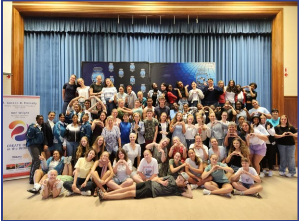
DG visit the Hermanus High School Interact Club which celebrates its 20th year in 2024.