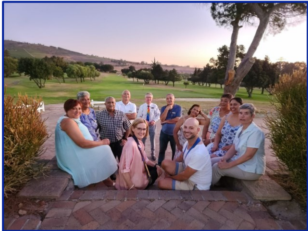
DG visit to RC Oostenberg at Kuilsriver Golf Club.