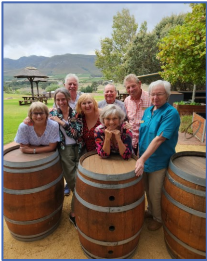
DG visit to RC Stanford lunch meeting in a brewery!