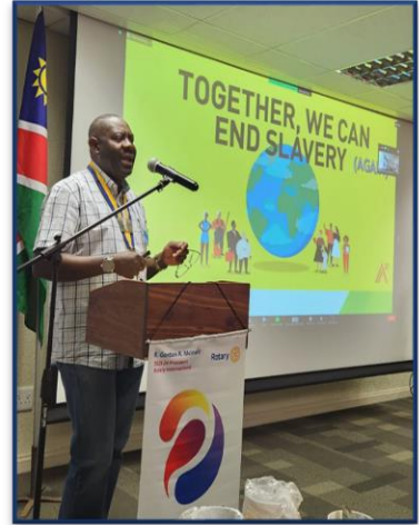
AG Edouard presented the facts around trafficking in Namibia.