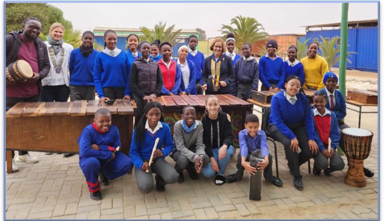
The MYO After-school children who entertained us with a recorder and marimba performances in Swakopmund.