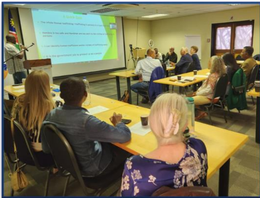
35 Namibian Rotarians attended the conference.