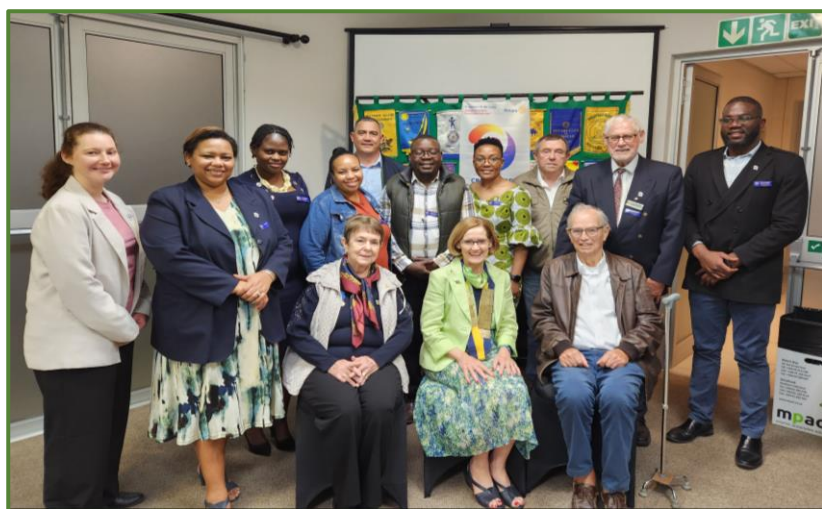
RC Walvis Bay Rotarians