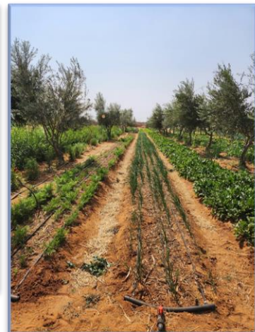
This is an excellent vegetable garden located at the second school.