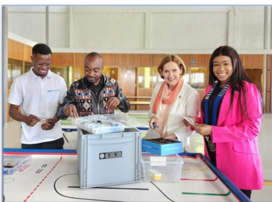
RCWA support an after-school programme, Mindsinaction STEAM project which is owned by 2 young engineer members.