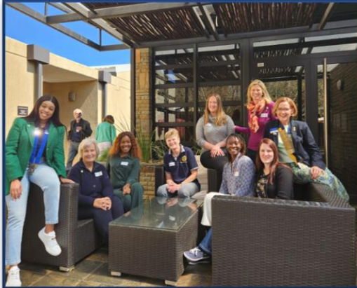
Les Girls at the Namibian mini-conference.