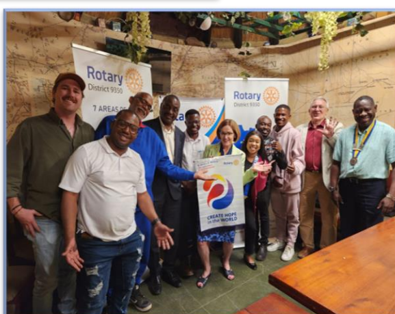
RC Windhoek Auas inducted 2 new members during the DG's visit.