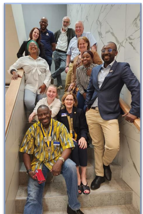
RC Klein Windhoek Valley visit.