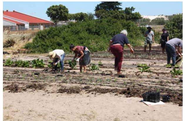
Rotarians planting crops