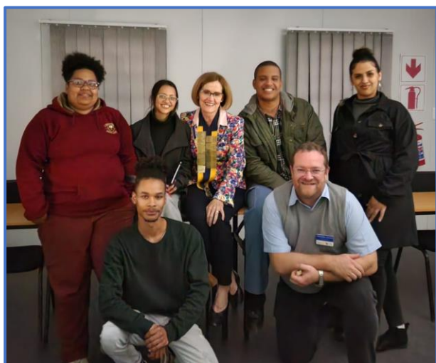
With the Atlantis Rotaracters.