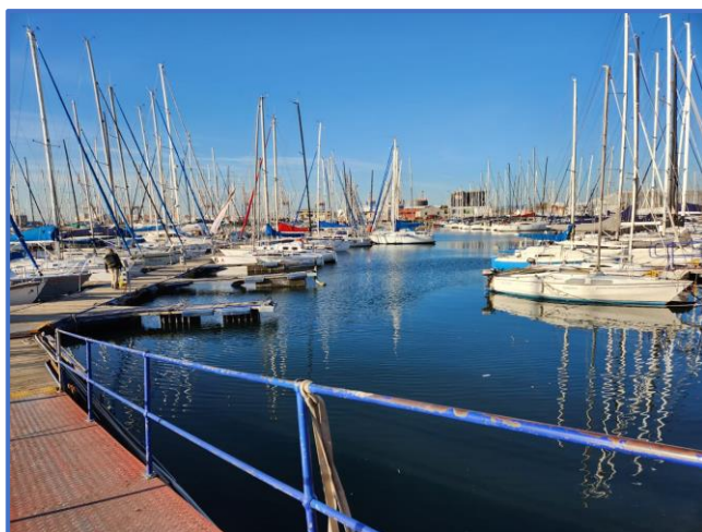
RC Cape Town meets at Royal Cape Yacht Club.