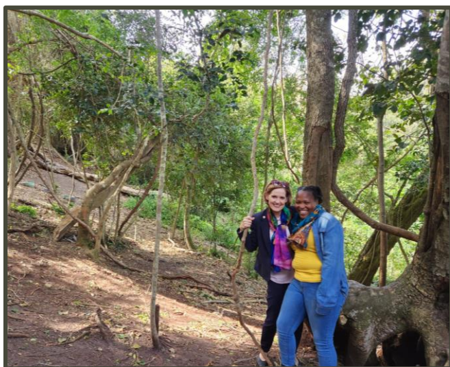
The forest was partially cleared allowing the children to have exciting adventures.