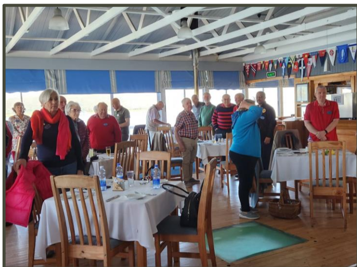
The Club meets at the Yacht Club at lunchtime.