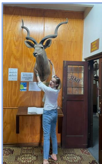
The Club meets at the Men's Club in town.