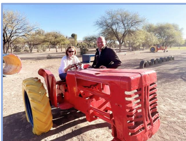
RCBW supports the popular children's playground in the town.