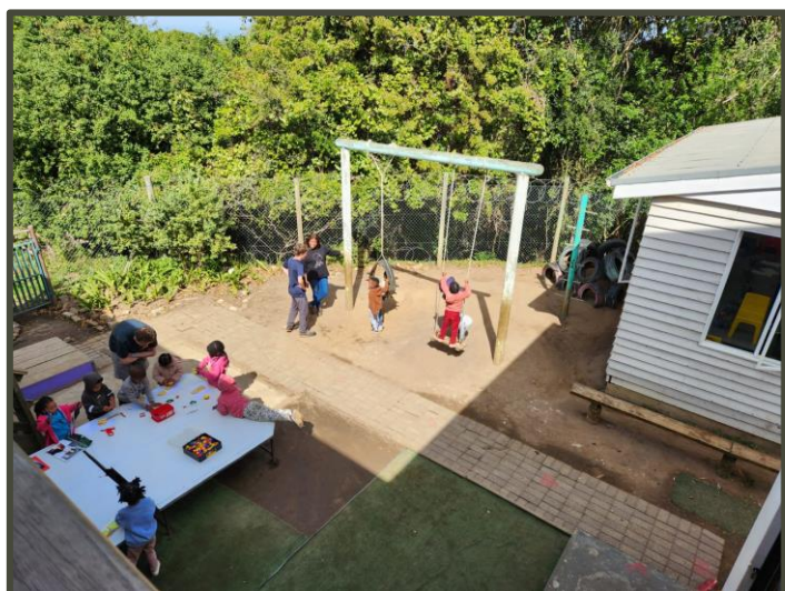
The Club supports many ECD schools in the townships. The Learning Tree school is a true centre of HOPE for the children.