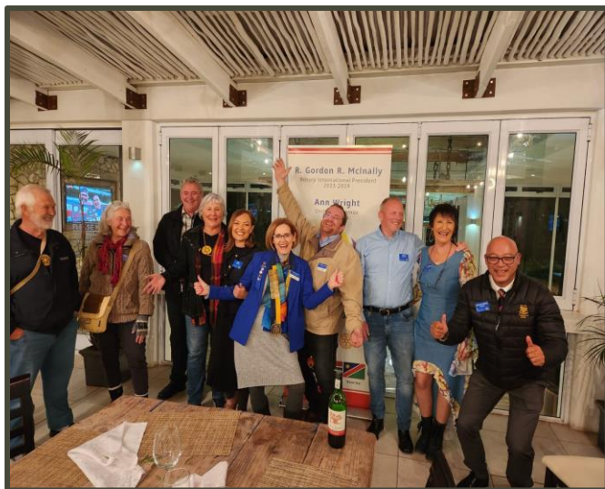
The passionate and sparkling Langebaan members.