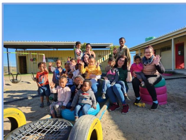
Oudtshoorn supports a creche in an impoverished area in Volmoed.