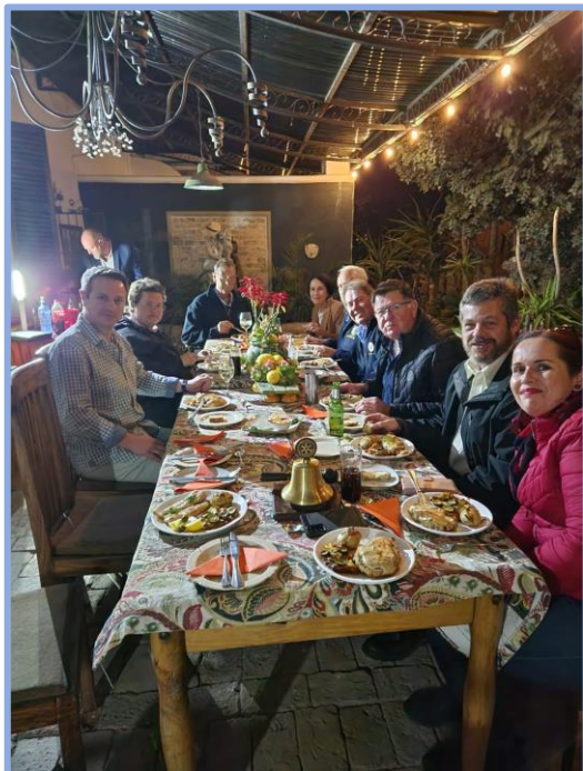
Special dinner by candle light during power outage.