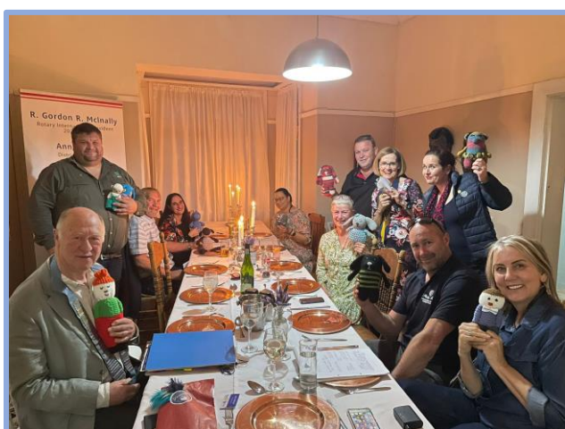
A special dinner was arranged for the DG's visit. The members make beautiful teddies. Last year 1000 teddies were given to children in their communities.