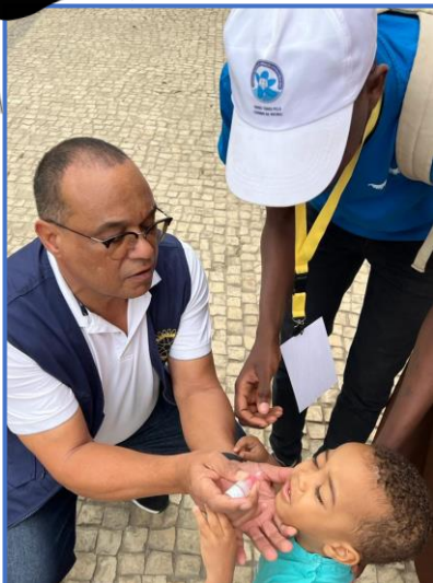
Rotarian administering polio drop