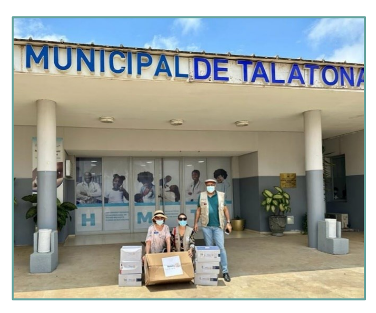
Rotarians regularly collect 'almost time expired' stock donations from pharmaceutical companies which they then deliver to state clinics and hospitals.