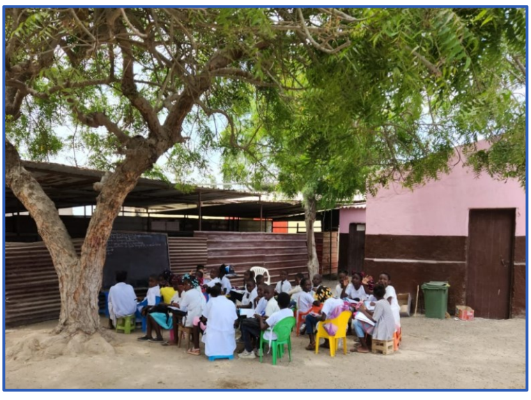
A classroom under a tree.