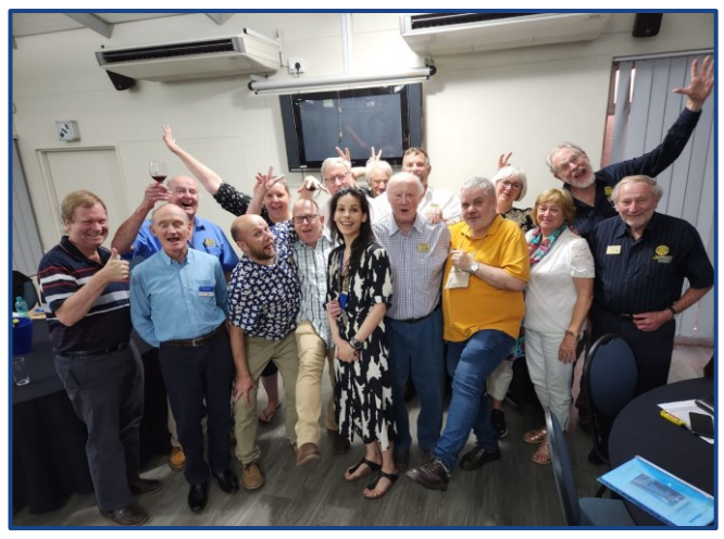
A happy group of Wynberg Rotarians.