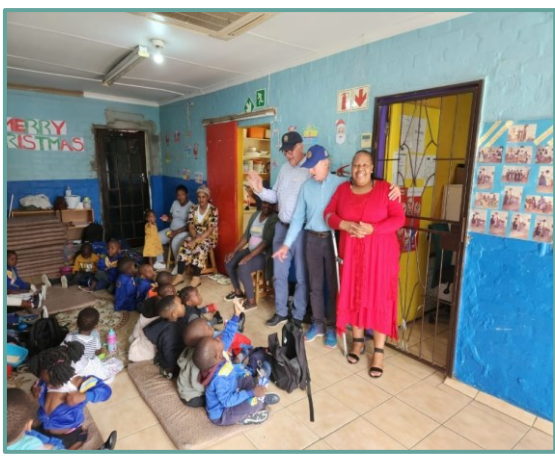
The club supplies e'Pap to IY creche in collaboration with the Lions Club.