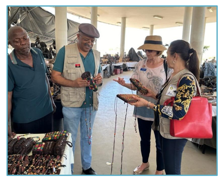
Craft market on the outskirts of Luanda