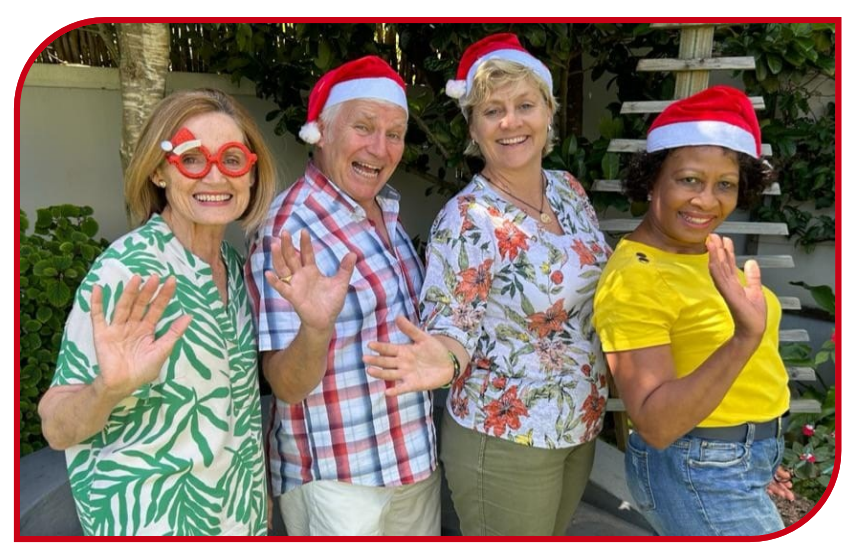
The District Governor Team wishes all Rotarians a peaceful and happy festive season.