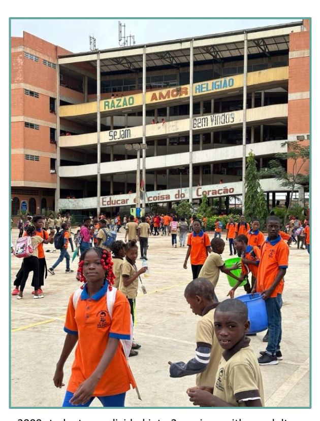
3000 \ students are divided into 2 sessions with an adult session at night.