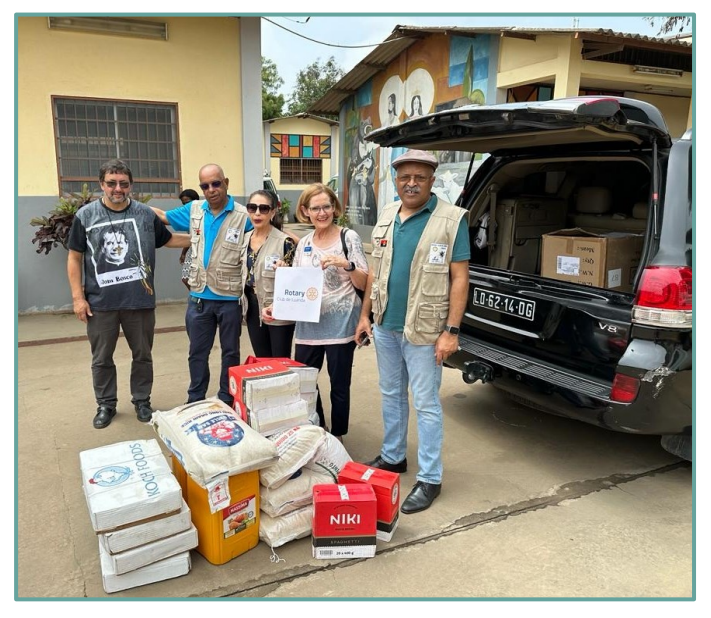
Delivering food and pregnancy tests to a Catholic school which also manages an orphanage.