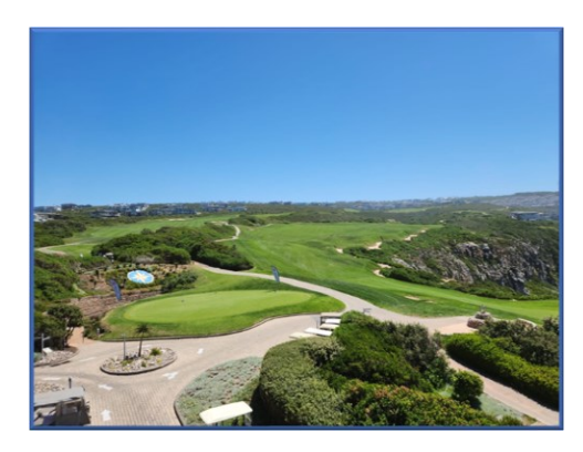
Pinnacle Point Golf Club

There will be fabulous opportunities for fellowship, connecting and, of course, catching up on all things Rotary.