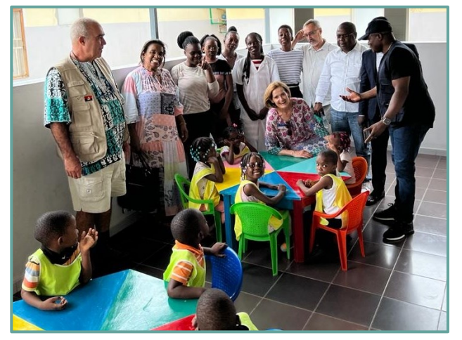
Luanda Sul supports an amazing facility for abandoned children which serves as their home and school.