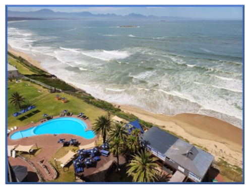
View from 11th floor Diaz Hotel