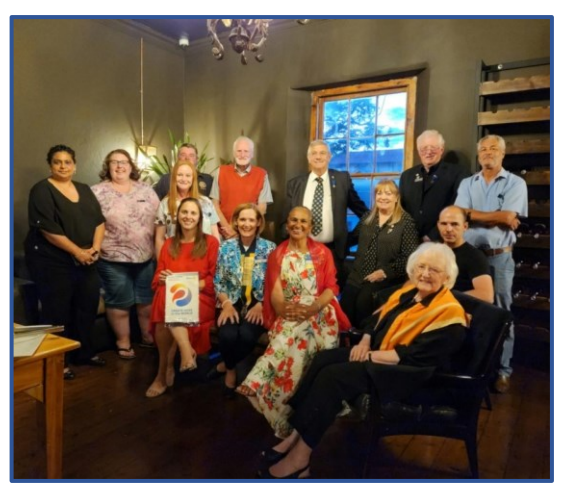
The Mossel Bay club is one of the oldest clubs in the district having chartered in 1952