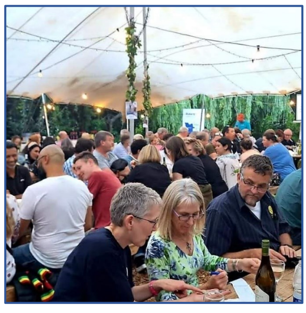
A very successful quiz evening.