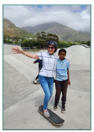
The DG having a lesson at the Hout Bay skate park, one of their previous projects