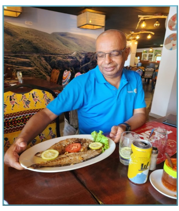
Lunch time for PP Manual Assis